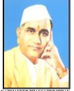
KARMAVEER BHAUSAHEB HIRAY