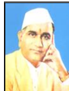
KARMAVEER BHAUSAHEB HIRAY